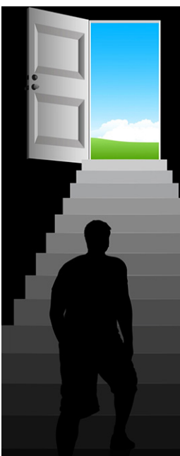
graphic: Applied Alliance